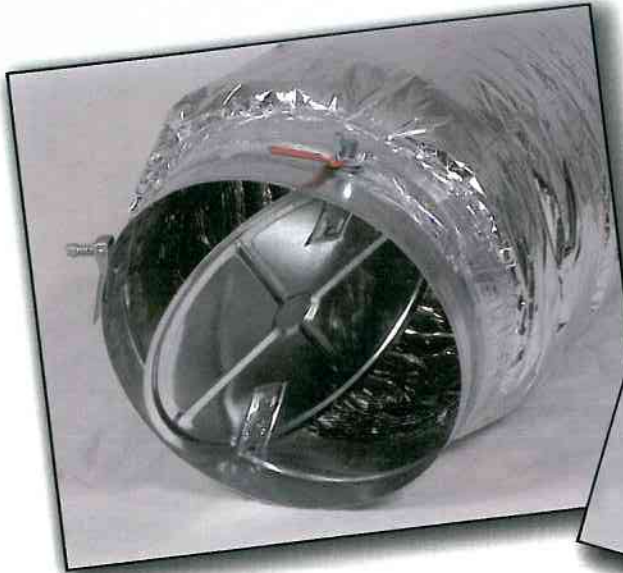
MODEL L-181M w/ CC/CC AND DAMPER