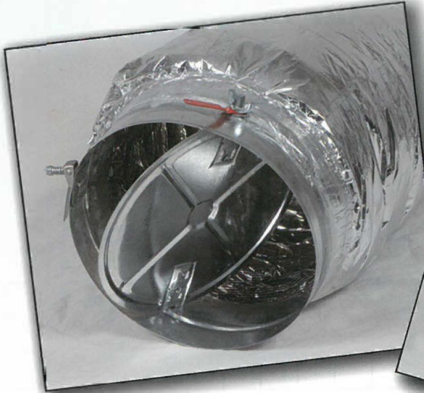
MODEL L-181M w/ CC/CC AND DAMPER